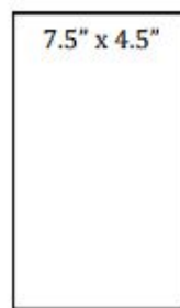
Full Page $50